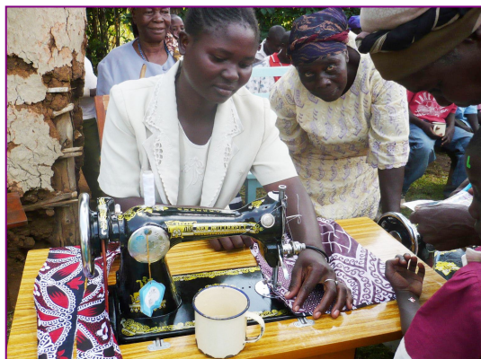
Jackets made locally in our coop sewing project