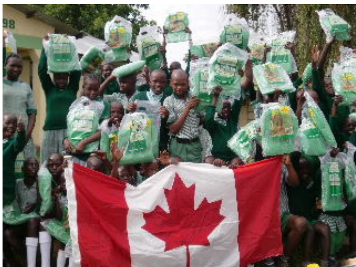
Distribution of locally made treated mosquito nets