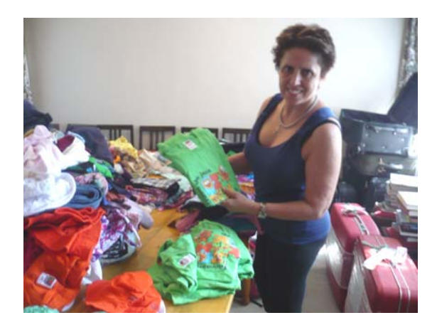
Canadians donated 27 suitcases of books, clothes, medical & school supplies