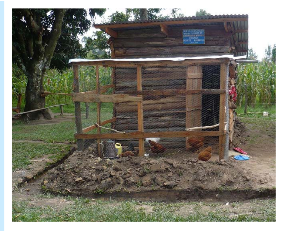
Something to cluck about !!

This year 4 new poultry projects were installed. Funding of a poultry project covers the cost of coop construction, feeding and watering apparatus, poultry vaccinations, 2 cocks and 18 laying hens. Also funded is a course of instruction on the care and management of the poultry by an animal health officer. To date in 2010 we have installed one each at Mukumu Home, Lion Hill, Upendo and Sacred Shrine Communities. A 5<sup>th</sup> is under construction now.