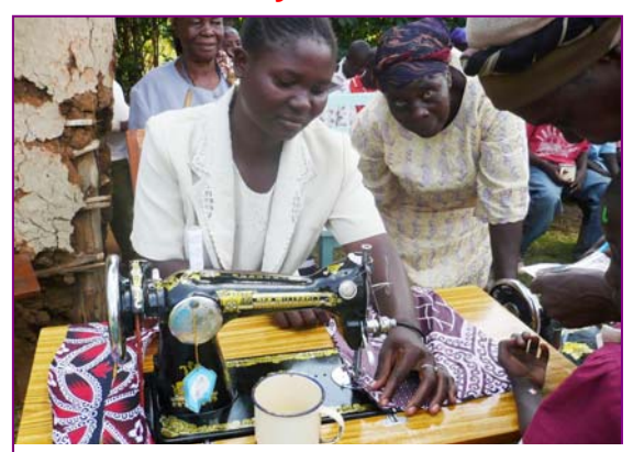
Jackets made locally in our coop sewing project