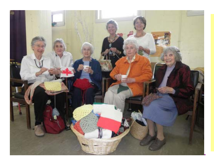
St George's Anglican Church Knitters

When we asked for volunteers to knit squares this winter we were astounded by your great response! We send our heartfelt thanks to all of those who filled our suitcases with a profusion of colors to choose from. We used them to sew blankets with the disabled children at St. Ursula Special School. The children were so delighted with this project and all the love and warmth of your gift was apparent. Visit our website for many happy photos of the day we shared.