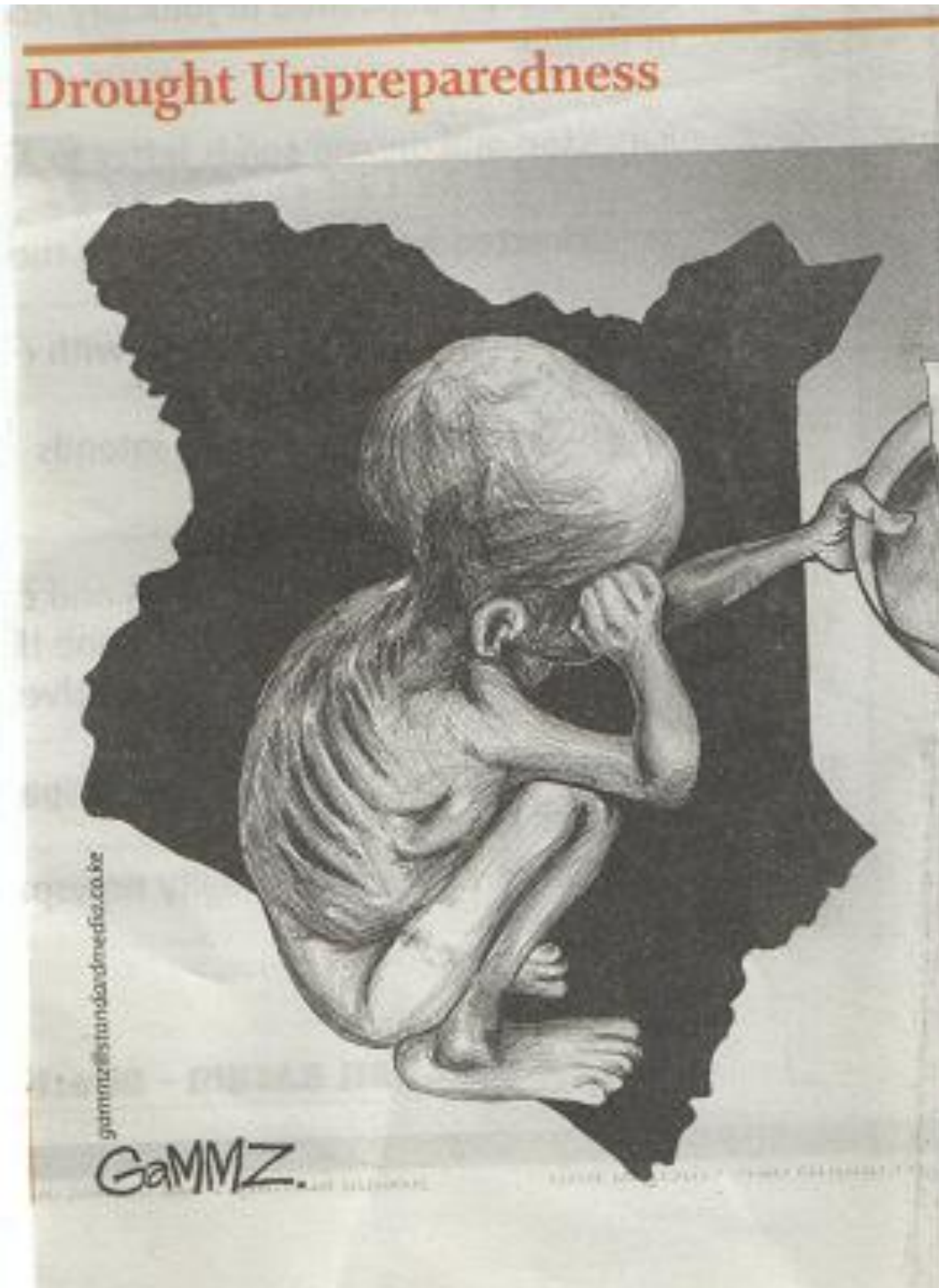
PHOTO 9: This is the artistic impression of Kenya. Kenya is in Sub-Saharan Africa. Alleviation of extreme poverty and hunger is the first and key millennium development goal that was agreed upon by 192 United Nations Member states headed by Jeffrey Sachs a Canadian. It is saddening that many years down the line, with only 4 years left to assess the success indicators of this goal many poor children in Kenya suffer from extreme hunger and poverty. They undergo through