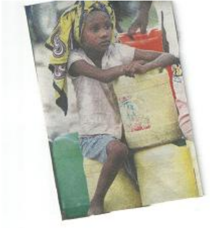
PHOTO 7: Many children waste a lot of their time waiting for water instead of concentrating on their school work.