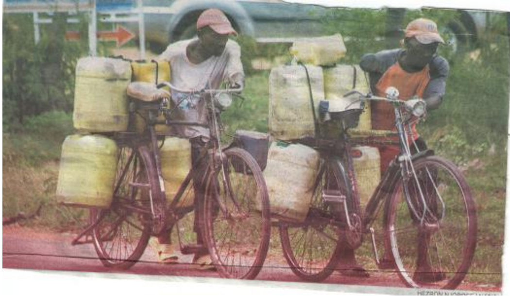
PHOTO 8: Men relieve their wives by fetching water on bikes. Many women incur back injuries as they carry heavy pounds of water.