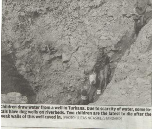
PHOTO 6: Many children die or sustain accidents while looking for this precious commodity.