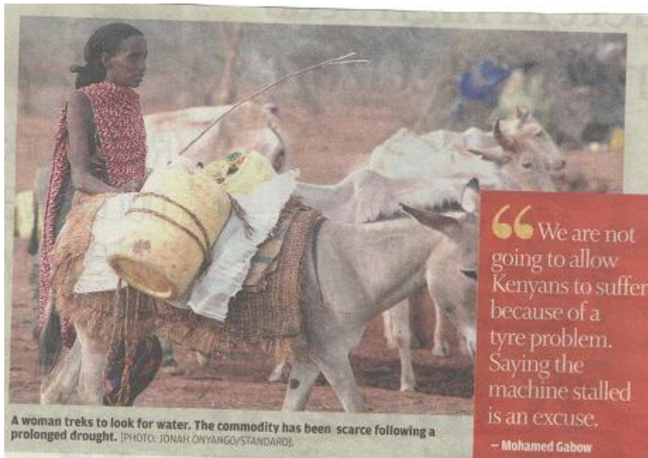
PHOTO 1: Women and children trek for longer distances to get water.

These newspaper cuttings from print media indicate the hustle and bustle Kenyan communities go through on a daily basis to get water. They support the facts above. The problems cut across the entire country.